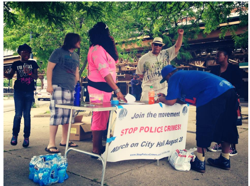
CAARPR conducting outreach by "tabling" in communities.

a) In the words of CAARPR Field Organizer and NAARPR