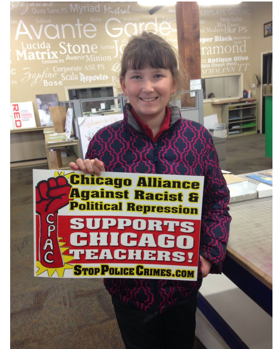
CAARPR sign in support of Chicago Teachers Union.

The coalition that fought for and secured this victory is an example of FRSO’s call to form and strengthen a strategic alliance between the national liberation movements - especially the Black liberation movement - and the multi-national working class. FRSO sees this strategic alliance as the core of a united front against monopoly capitalism which is essential to a strategy for socialist revolution.