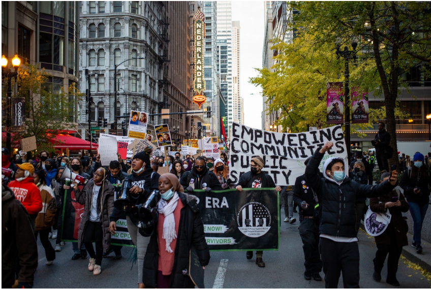
March for ECPS in Chicago.

by the Labor Commission of Freedom Road Socialist Organization