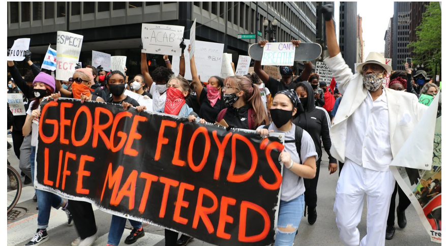
Chicago marching for George Floyd, May 30, 2020.

fought for by Special Ed teachers, as Laquan was a Special Ed student. Over the next five years, CPAC gained the support of unions with a total membership of 200,000.